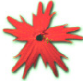
Red Flower: Courage and Gallantry