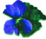
Blue Flower: Love of Country