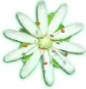
White Flower: Devotion to Duty