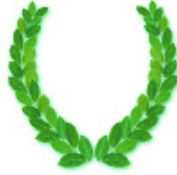
Laurel Wreath: Victory Over Death